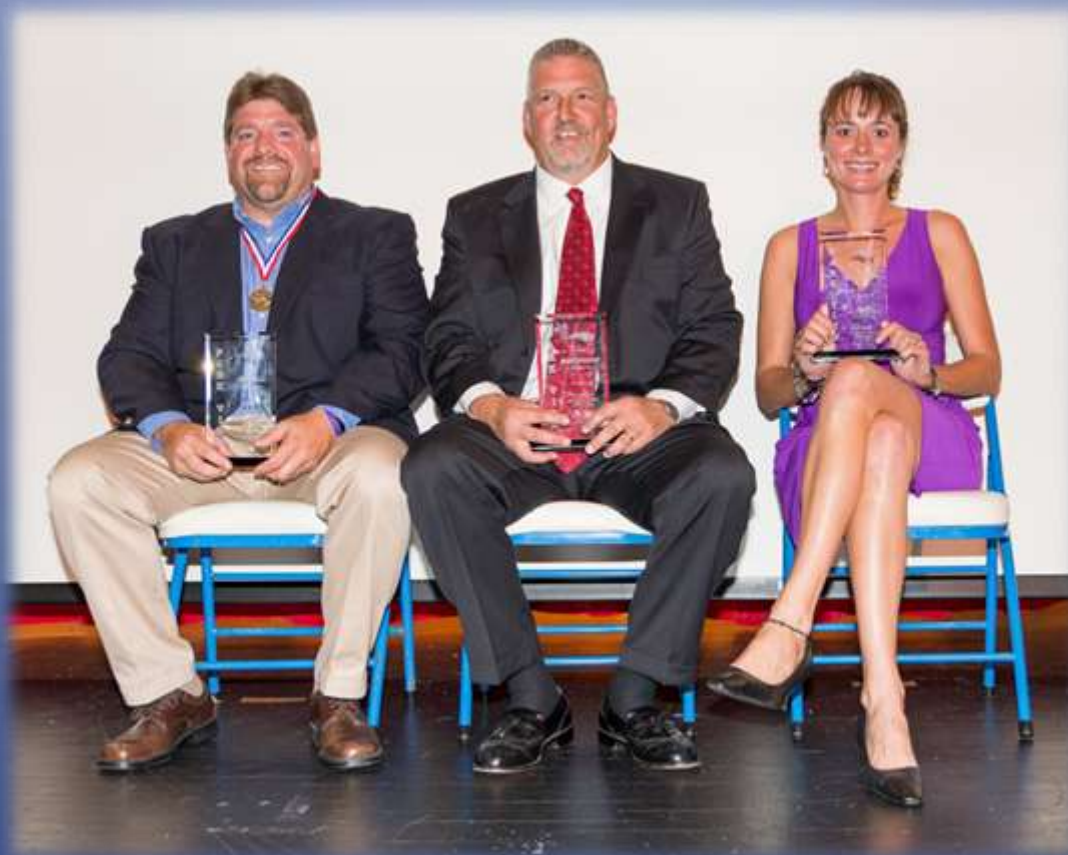
Class of 2013