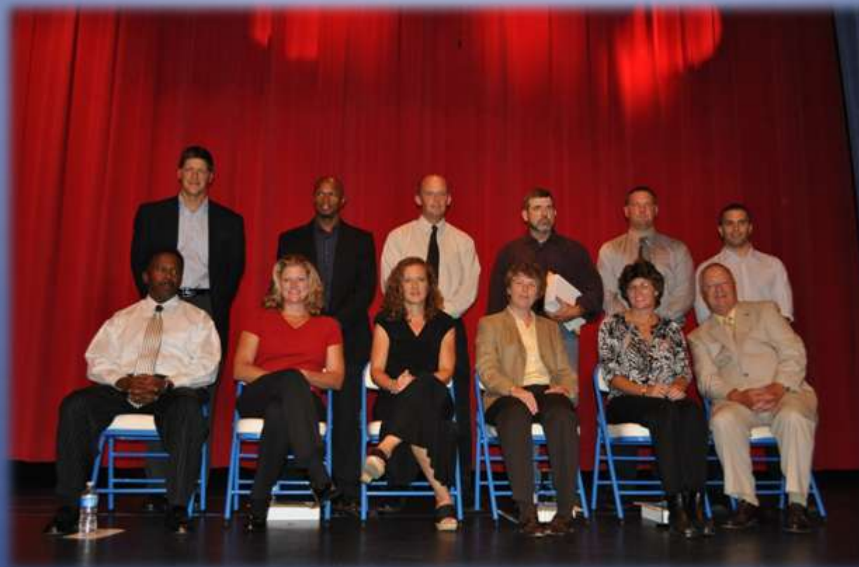
Class of 2011